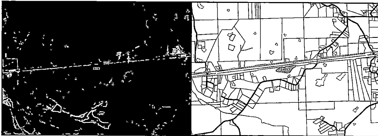
AERIAL MAP SCALE: 1"=1,000'